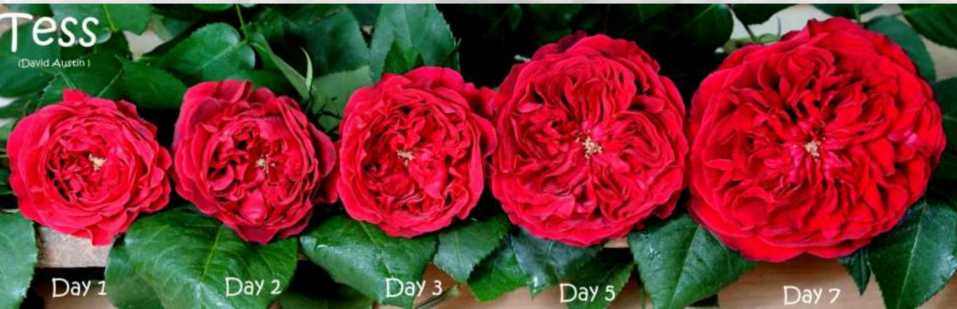
Tess (David Austin)

Tess is an elegant dark red rose that opens up completely flat. She has strong petals that are great for shipping and a great vase life that makes her great for vase work. She has an English Garden shallow cup shape and needs 4-5 days in water before she is ready for a party.